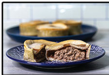
Scottish Meat Pies

Ackroyd's Scottish Bakery is a 3rd generation, woman-owned small business specializing traditional Scottish fare.