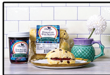
Scones & More!

Just head to ackroydsbakery.com to place an order, and use code CEILIDH2025 to save 10% off your first order!